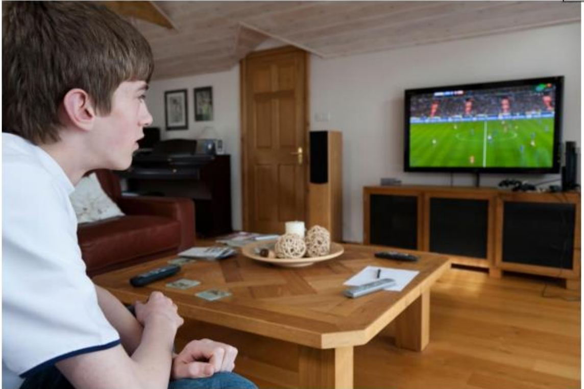
Figure 2 Speaking material 2. Pre-test